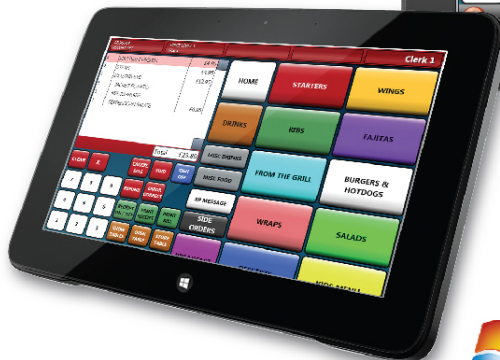
Featured hardware includes a Sam4s Titan 160 Touch Screen & Windows Tablet.