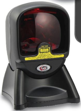
Featured hardware includes a Sam4s Titan 160 Touch Screen & XL-2020 Scanner.